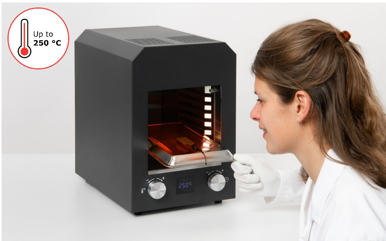
Figure 1 FHF06 high temperature foil heat flux sensor being used to monitor the performance of an oven. The sensor is suitable for use under continuous exposure to temperatures up to 250 °C.

Do you need a thin, flexible and sensitive heat flux sensor that can withstand high temperatures? Hukseflux, the world market leader in heat flux measurement, introduces the FHF06 foil heat flux sensor. Rated temperature range is from -70 to +250 °C. FHF06 measures heat flux from conduction, radiation and convection. In case you do not need the high temperature range, look at our FHF05 series . If FHF05 or FHF06 do not comply with your requirements, have a look at other heat flux sensor models for special applications.