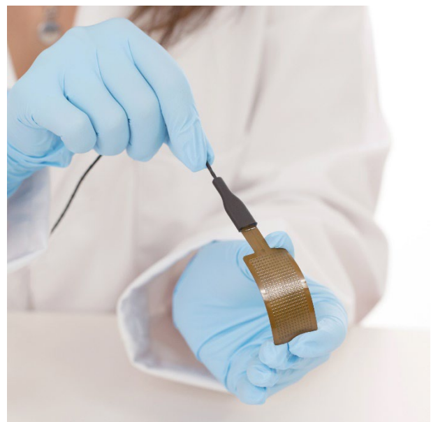
Figure 3 FHF06, thin and flexible, can be easily mounted on a curved surface like a pipe or tube.

**** sensor foil only (without cable and connection block) may be used in vacuum.