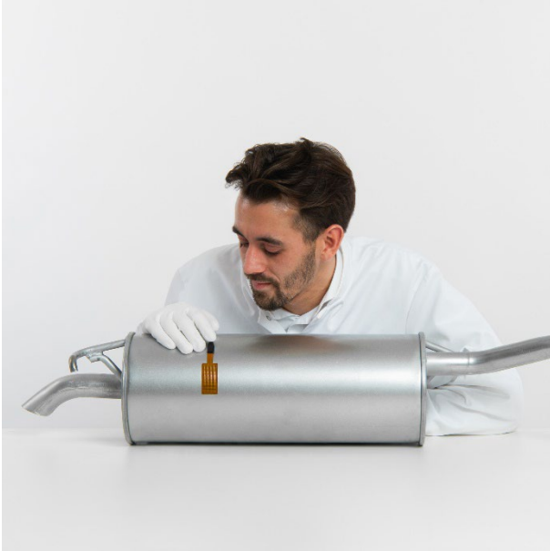
Figure 2 FHF06 high temperature foil heat flux sensor installed for measurement on a car exhaust pipe. The sensor is mounted on a curved surface.

Multiple small thermal spreaders, which form a conductive layer covering the sensor, help reduce the thermal conductivity dependence of the measurement. With these incorporated spreaders, the sensitivity of FHF06 is independent of its environment.