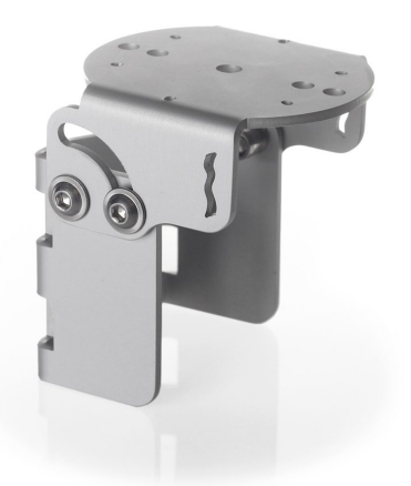
Figure 5 PMF01 mounting fixture accessory: practical, small footprint, and allowing horizontal and plane of array installations on various platforms