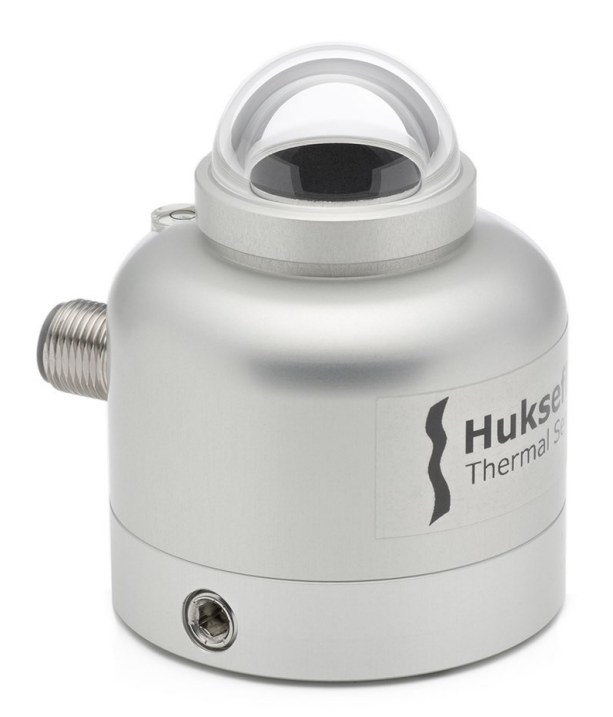
Figure 1 SR05-D1A3-PV pyranometer

SR05 series is the most affordable range of pyranometers meeting ISO 9060 requirements. These sensors are ideal for general solar radiation measurements and popular for monitoring PV systems. Model SR05-D1A3-PV is made as a perfect alternative to PV reference cells. It offers the same Modbus interface as the most common PV reference cell model for easy compatibility. Relative to PV reference cells, SR05-D1A3-PV has the advantage of higher stability, independence of the PV cell type or anti-reflection coating, and better availability and price of recalibration.