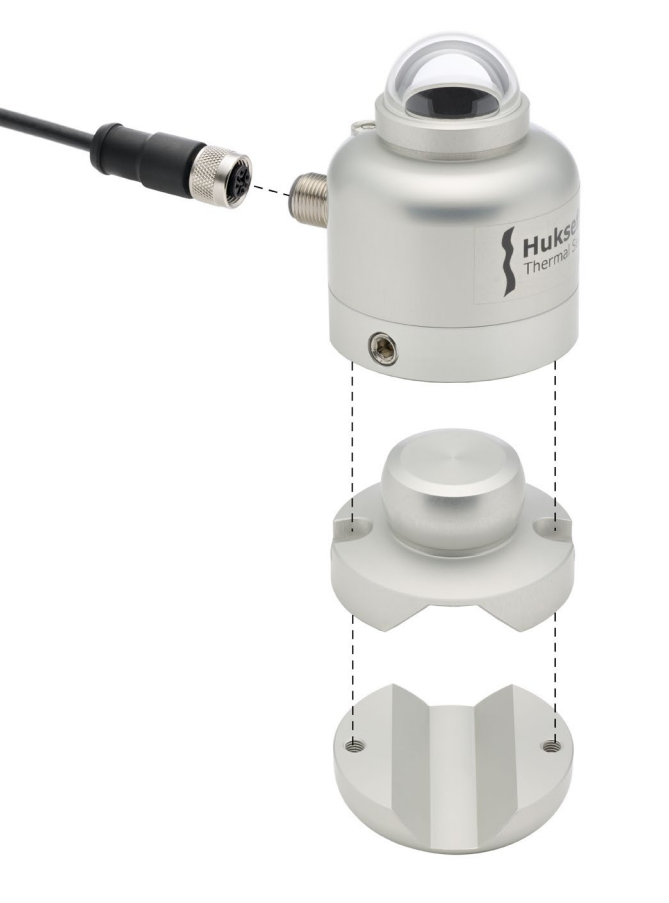
Figure 3 'Exploded view' of SR05-D1A3-PV. The optional ball levelling and tube mount allow for easy installations. The cable (standard 3 m) has an M12-A connector.

SR05 pyranometers employ a thermopile sensor with black coated surface, one dome and an anodised aluminium body with visible bubble level. Optionally the sensor can be delivered with a unique ball levelling mechanism and tube mount or dedicated mounting fixture, for easy installation. SR05-D1A3-PV has an industry standard digital output: Modbus RTU over halfduplex RS-485, that allows multiple sensors to be installed on a single network. In addition, SR05-D1A3-PV has analogue 0-1 V output.