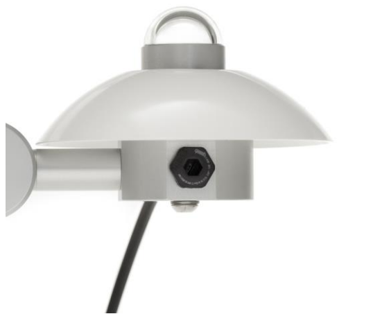
Figure 4 RA01 2-component radiometer in detail: pyranometer model SR01

Applicable instrument-classification standards are ISO 9060 and WMO-No.-8; Guide to Meteorological Instruments and Methods of Observation.