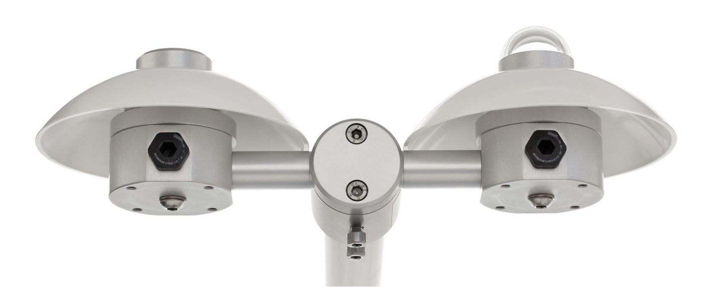
Figure 1 RA01 2-component radiometer

RA01 is a market leading 2-component radiometer, mostly used in scientific-grade energy balance and surface flux studies. It offers 2 separate measurements of solar and longwave radiation. Product features include a modular design, low weight, and easy levelling, and low solar offsets in the longwave measurement. The unique capability to heat the pyrgeometer reduces measurement errors caused by dew deposition. When combined with estimates of solar albedo and of local surface temperature, this instrument can also be used for estimation of net radiation. The advantages of this approach are cost reduction and independence from local surface properties.