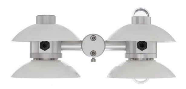
Figure 4 NR01 4-component net radiometer, including two pyranometers, two pyrgeometers, heater and 2-axis levelling assembly (mounting tube not included)