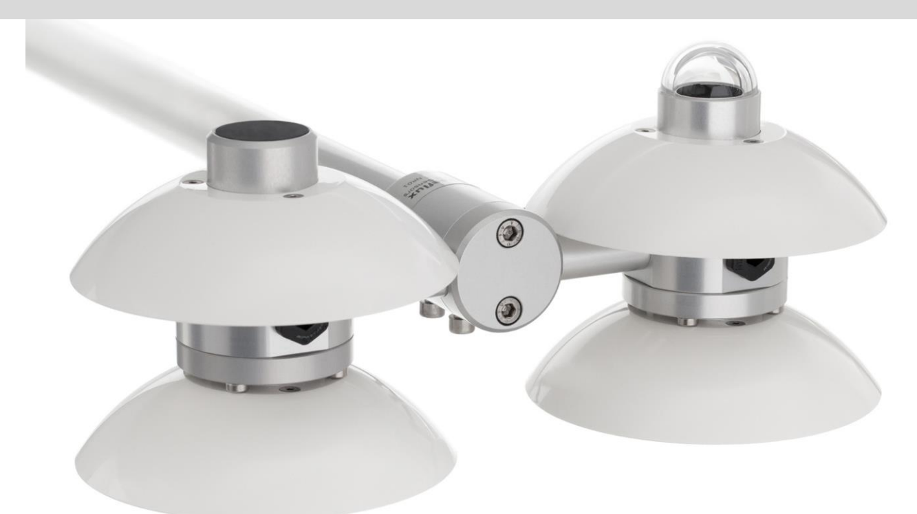
Figure 1 NR01 4-component net radiometer

NR01 is a market leading 4-component net radiation sensor, mostly used in scientific-grade energy balance and surface flux studies. It offers 4 separate measurements of global and reflected solar and downwelling and upwelling longwave radiation, using 2 sensors facing up and 2 facing down. NR01 owes its popularity to its excellent price / performance ratio. Advantages include its modular design with 2 pairs of identical sensors, low weight, ease of levelling, and low solar offsets in the longwave measurement. The unique capability to heat the pyrgeometers reduces measurement errors caused by dew deposition.