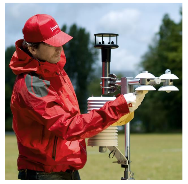
Figure 2 NR01 in use in a typical meteorological station