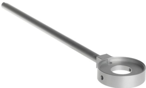
Figure 1 AMF02 or AMF03 albedometer kits are used to mount both an up- and a downfacing pyranometer, and construct an albedometer. The image shows the AMF02 mounting fixture and its rod. A glare screen for the downfacing sensor is also included.

Hukseflux offers a full range of dedicated, ready-to-use albedometers for measuring albedo. Alternatively, with the AMF03 or AMF02 mounting fixture in AMF / ALF series, you may choose to construct albedometers from popular Hukseflux pyranometers yourself. AMF03, AMF02 and SRA series albedometers can be levelled with ALF01 levelling fixture.