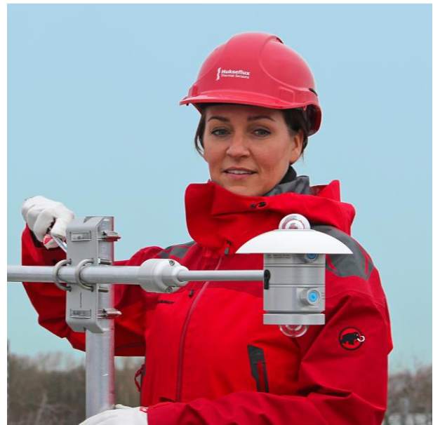
Figure 6 installation of AMF02 albedometer mounting kit and two SR20 pyranometers, mounted with ALF01 levelling fixture on a crossarm with crossarm bracket CMF01.