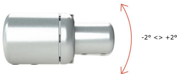
Figure 2 ALF01 albedometer levelling tool, can be rotated around the axis of the crossarm to which it is connected, and tilted over \pm 2^\circ .