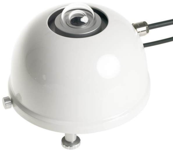
Figure 3 VU01 ventilation unit with SR20 pyranometer