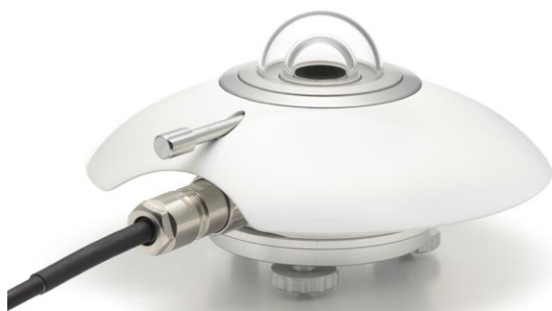
Figure 1 SR20 secondary standard pyranometer; also employed for sunshine duration measurement

NOTE: the fact that a sensor is used in a network does not constitute a formal endorsement by the network owner.