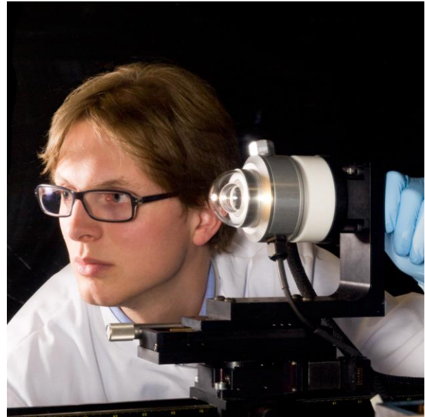
Figure 4 Calibration systems are also commercially available

Hukseflux provides indoor calibration equipment for pyranometers (indoor calibration according to ISO 9847, Type IIc). Advantages of this product: suitable for all pyranometer models, operation in a normal laboratory environment (no darkroom required), small area footprint and no need for additional air-conditioning (all lamp power is led outside with forced ventilation).