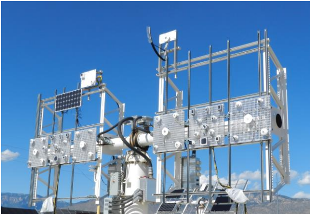
Figure 1 The 2-axis tracking facility at Sandia National Laboratories

Hukseflux is proud to notice pyranometer model SR20's performance during independent testing by PV Performance Labs (a consultant to the PV industry) supported by the European Commission Joint Research Centre's European Solar Test Installation and the US Department of Energy's Sandia National Laboratories.