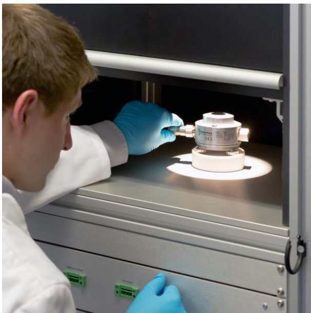
Figure 2 Pyrgeometer during conformity assessment at Hukseflux