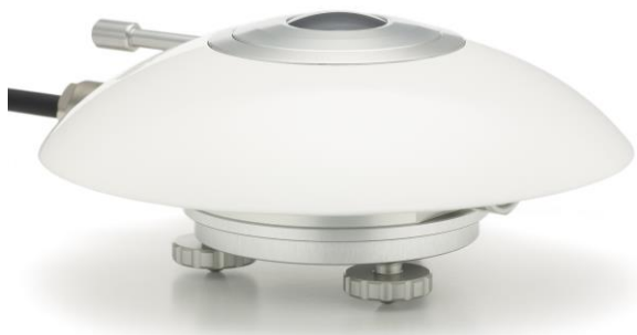
Figure 6 IR20 research grade pyrgometer