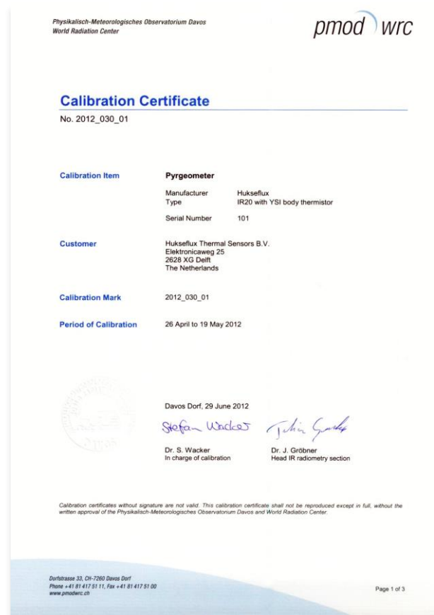
Figure 4 PMOD certificate of IR20

The spectral range of longwave radiation is not standardised. IR20 has a dome with a solar blind filter with a cut-on at 4.5 \times 10^{-6} m, making it suitable for day- and night observations. Model IR20WS has a wide spectral range with a cut-on at 1.0 \times 10^{-6} m. It offers a superior accuracy during night-time, when solar radiation is absent. IR20WS is suitable as well for uncertainty assessments and as a calibration reference.