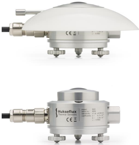
Figure 1 IR20 & IR20WS research grade pyrgeometers

Hukseflux invested heavily in developing the infrastructure to manufacture, test and calibrate research-grade pyrgeometers. These efforts resulted in the IR20 & IR20WS pyrgeometers, released April 2013.