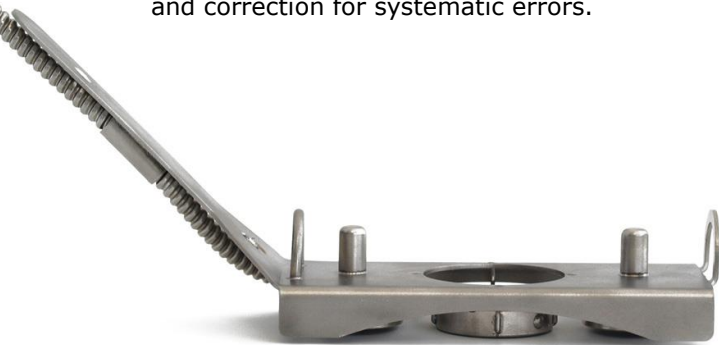
Figure 3 HF01 with frame with magnets

HF01 is most suitable for relative measurements using one sensor, i.e. monitoring of trends relative to a certain reference point in time or comparing heat flux at one location to the heat flux at another location. If the user wants to perform accurate absolute measurements with HF01, as opposed to relative measurements, the user must make his own uncertainty evaluation and correction for systematic errors.