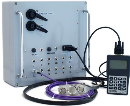
Figure 4 the ALUSYS measuring system, for trend - monitoring and comparative surveys of heat fluxes and surface temperature on industrial installations. Connected is one HF01 sensor, as well as the Keyboard Display.

trend-monitoring and comparative measurement of heat flux and surface temperature in industrial installations.