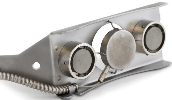
Figure 1 HF01 with frame with magnets

HF01 high temperature heat flux sensor measures heat flux and surface temperature at high temperatures, typically in industrial environments. It is particularly suitable for trend-monitoring and comparative testing. The same technology can be used to manufacture heat flux sensors for different applications.